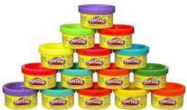
Playdough or Slime