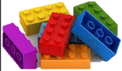
Legos or Building