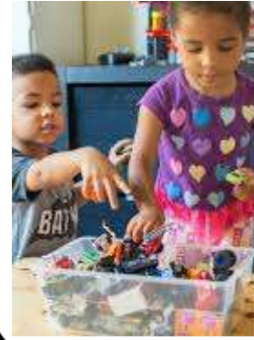
Clean up toys