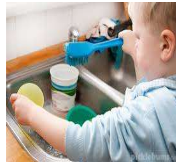
Clear the table