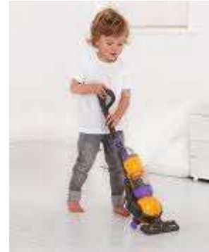
Vacuum living room & around kitchen table