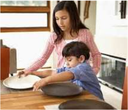
Set the table